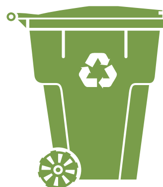
MEDIUM (Default Service)