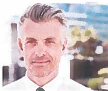
9 Retirement Planning Mistakes to Avoid in Your 60s (Fisher Investments)