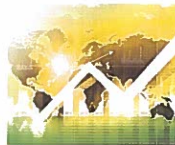
10 Stocks Under $15 With High Dividend Yields (Liberty Through Wealth )

↶ Back to Colorado Sales Tax Handbook (/colorado)