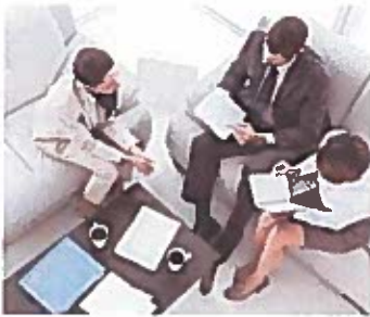
Financial Advisors: How to Communicate Your Unique Value Proposition (E*TRADE Advisor Services)